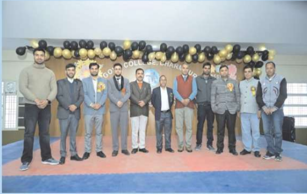
Young & Dynamic Faculty