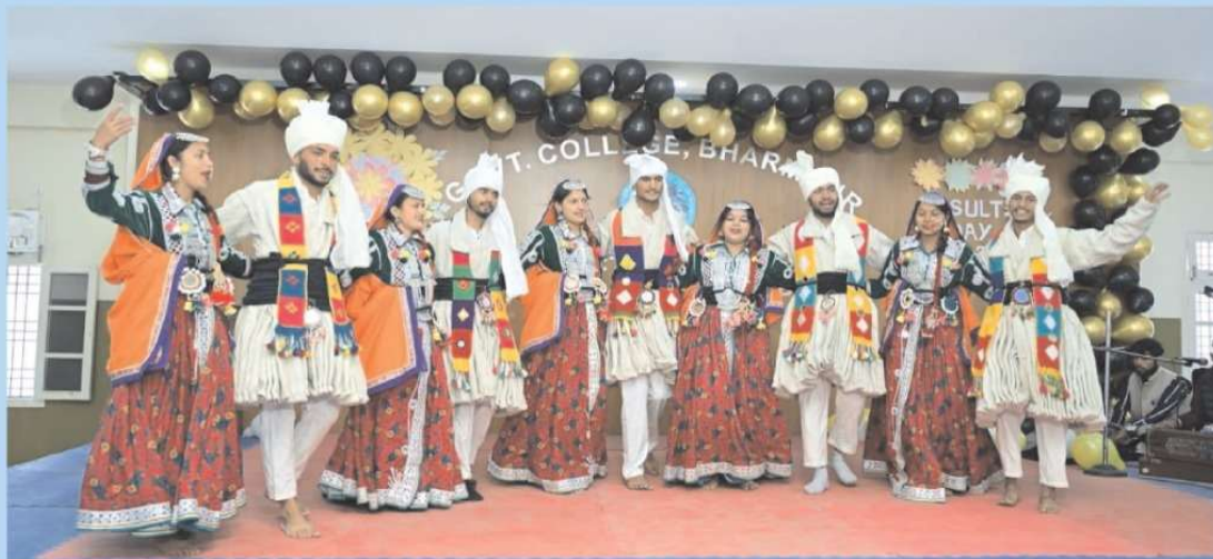
Annual Prize Distribution Function 21st March 2026