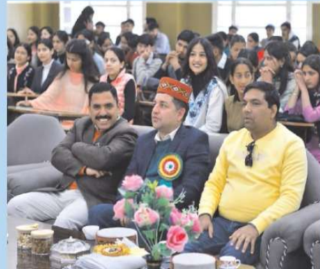
Annual Day Function 2026